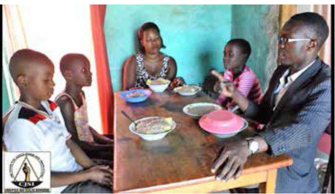
Olujuliro according to Buganda custom & traditions