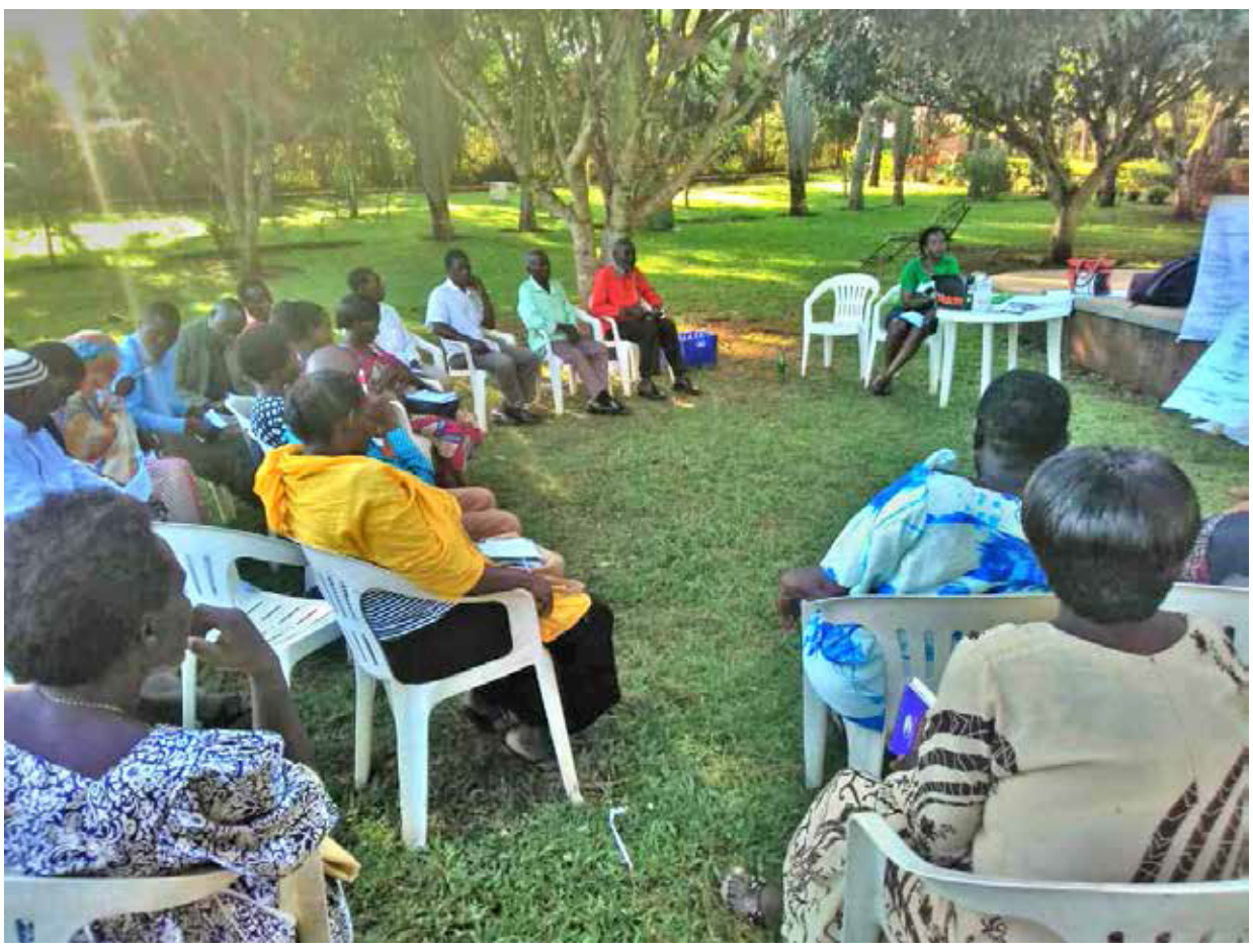
A meeting with community members in Mawokota