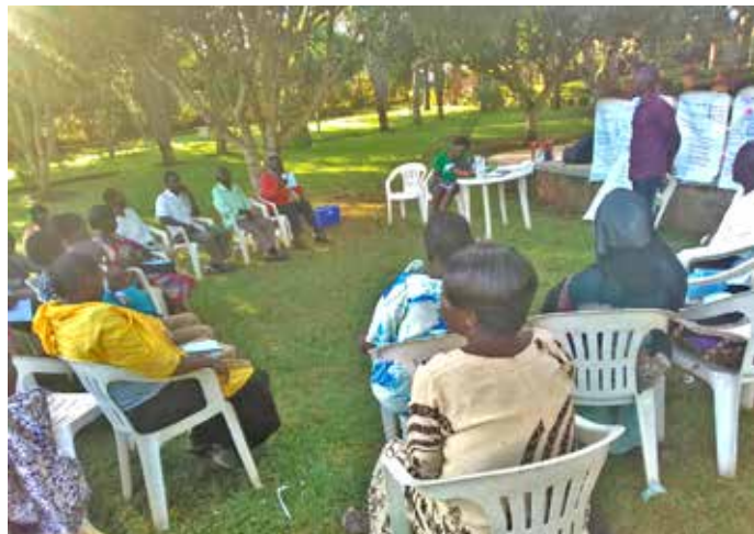
Meeting with opinion leaders in Mawokota