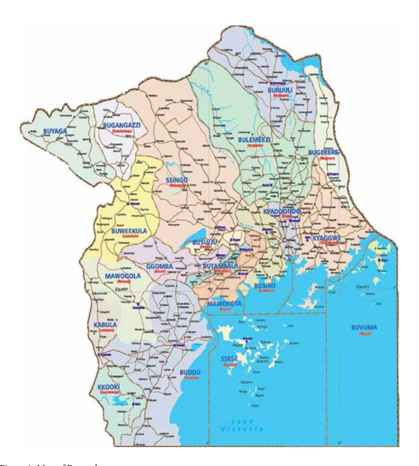
Figure 1: Map of Buganda